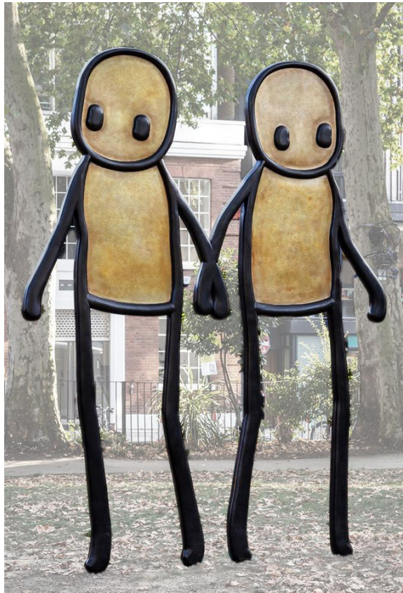
"Holding Hands" in Hoxton Square, sculpture by STIK

Working hand-in-hand to improve the sexual and reproductive health of young people in the City of London and Hackney